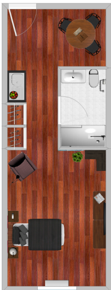
BROOKSIDE DELUXE SUITE 423 SQ FT

Built as an addition to the original facility in 2007, the Brookside wing features spacious private, semi-private and companion suites. Our all-inclusive rates include the features and services listed below. Medicaid is accepted.