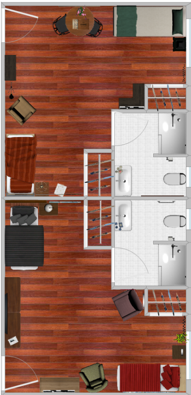
CREEKSIDE COMPANION SUITE 217 - 297 SQ FT

Our Creekside suites, located near the main building entrance, are part of the original facility built in 2003. Creekside is perfect for residents who wish to be closer to the building's common areas and dining room. Our all-inclusive rates include the features and services listed below. Medicaid is accepted.