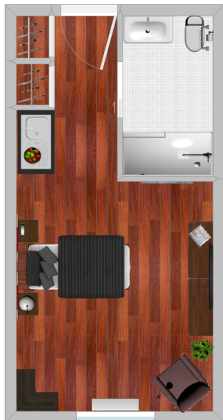
BROOKSIDE EFFICIENCY SUITE 258 SQ FT